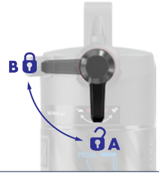
ROCKSHOX DELUXE (w/LINEAR XL AIRCAN) SELECT+ | Shock Lockout Lever

When the lockout adjuster lever is in the (B) Lock position the shock will resist compressing into its travel until significant bump impact or downward force occurs.