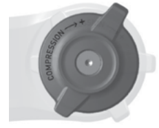
ROCKSHOX PIKE BASE | Fork Compression Adjust

Compression damping adjustment controls compression stroke speed, or the rate at which the suspension compresses. Compression affects bump absorption and efficiency during rider weight shifts, transitions, cornering, bump impacts, and braking.