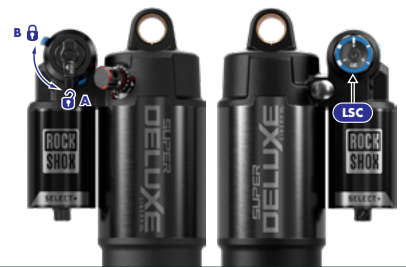
ROCKSHOX SUPER DELUXE SELECT+ w/LINEAR XL AIRCAN Shock Lockout Lever + Compression Dial