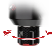
ROCKSHOX LYRIK BASE/ULTIMATE Fork Rebound Dial